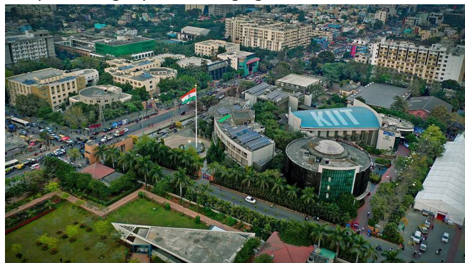
Drone view of KIIT Campus, India

KIIT provides excellent ambience for national and international conferences and seminars. The Central Convention Centre Complex houses a world-class Auditorium having a seating capacity of 1600, and Suite Guest House with 5-star facilities, 18 Conference Halls, Exhibition Halls, and Banquet Halls. There are 20 Open Air Theatres on campus having capacities ranging from 500 to 50000.