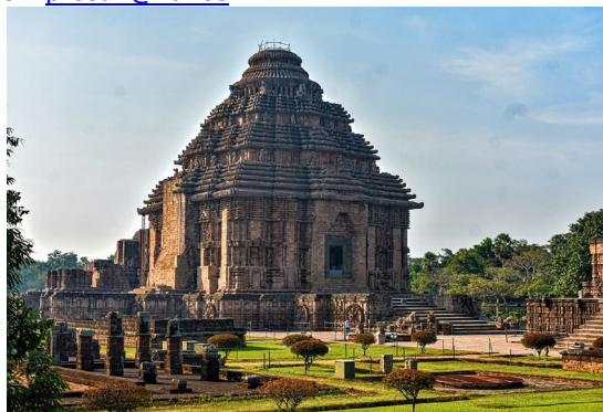
The Konark Sun Temple

https://en.wikipedia.org/wiki/Konark_Sun_Temple